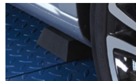
Truncated pyramid pad