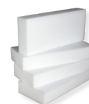
Polymer pads 50x150x340 mm