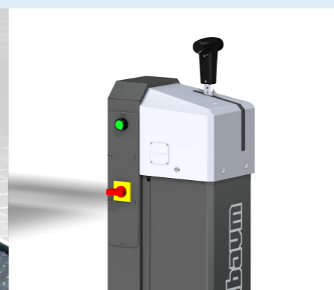
Very flat construction: Ideal for very low clearance vehicles